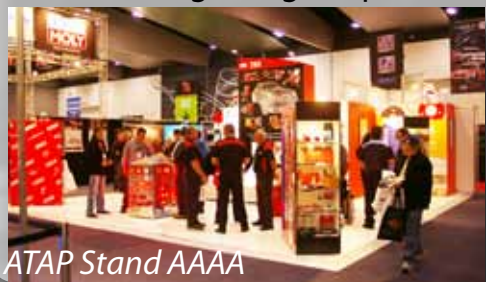
ATAP Stand AAAA

Thanks to all who came and visited us to chat to our staff and to see the huge range of product