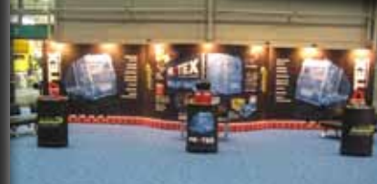
Brisbane Truck Show