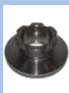
PG 2 Product Bulletins