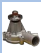
PG 1 Protex Gold Water Pumps