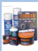
PG 1 Permatex FOCUS