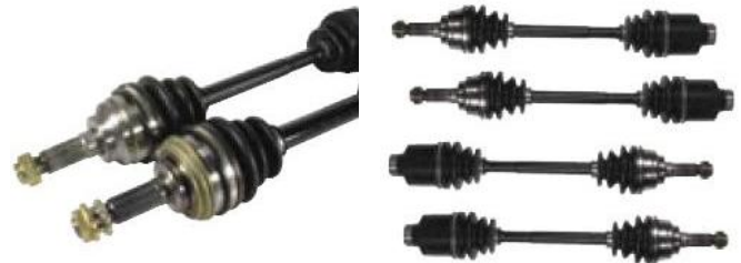
Protex— The standard in auto parts

currently consists of Driveshafts, CV and steering rack boots and a comprehensive range of wheel bearing kits which compliments the extensive range of Protex Disc Rotors. ATAP's new range is competitively priced and the 2nd edition of the catalogue is now available.