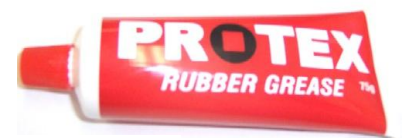
RG17- Rubber Grease