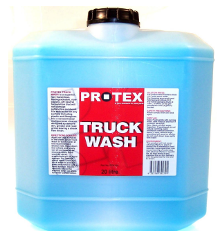
PTW-20L (20 litre)

forms equally well in hard and recycled water. Containing corrosion inhibitors to guard against harmful oxidation, the wash is 100% biodegradable and is quick in breaking down and complies with local government regulations. It is free from harmful ingredients such as solvents and caustic and contains anti-redispersion additives to prevent streaking and residual films. The wash is also a very good cleaner that has a multitude of applications such as laundry liquid, shower cleaner etc.