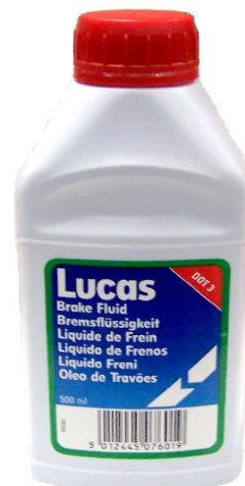
PFB 350 (500ml bottle)

rior quality brake fluid manufactured by TRW, branded Lucas in a red capped highly distinguishable air tight bottle. The red cap ensures the consumer does not mistake Dot - 3 for Dot - 4 which comes in a blue capped bottle.