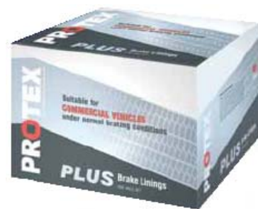
Protex Plus Brake Linings

PROTEX TBK are specifically designed for heavy duty, Japanese applications only. For any further information on our Protex range please contact your local ATAP office.